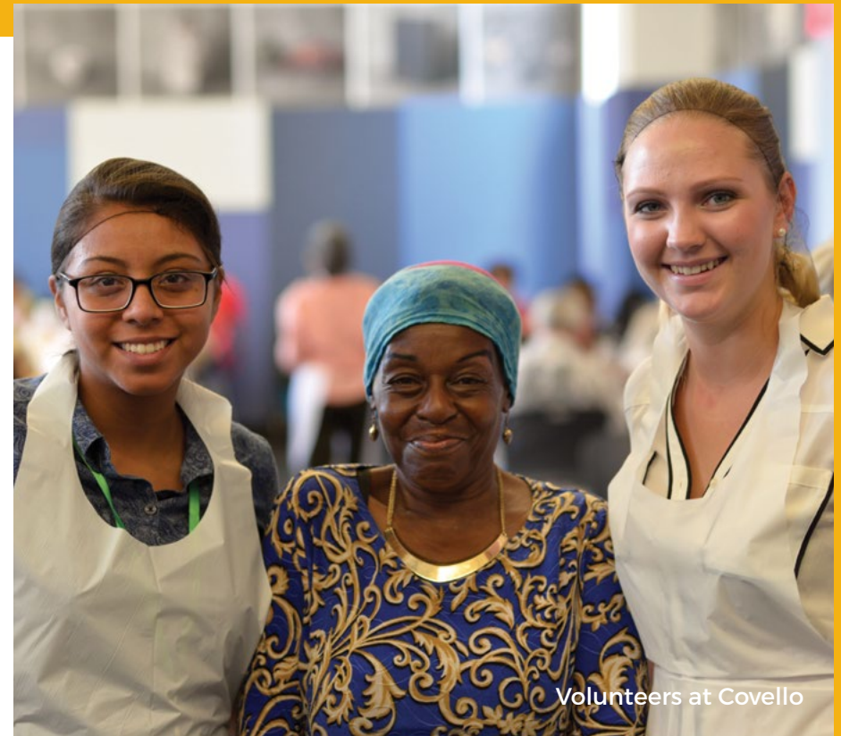
Volunteers at Covello

Our delivery of social services and case management means connecting you to resources by drawing upon our understanding of how benefits work, and how to make them work for you. CBN offers assistance to help address your concerns individually, confidentially and effectively.